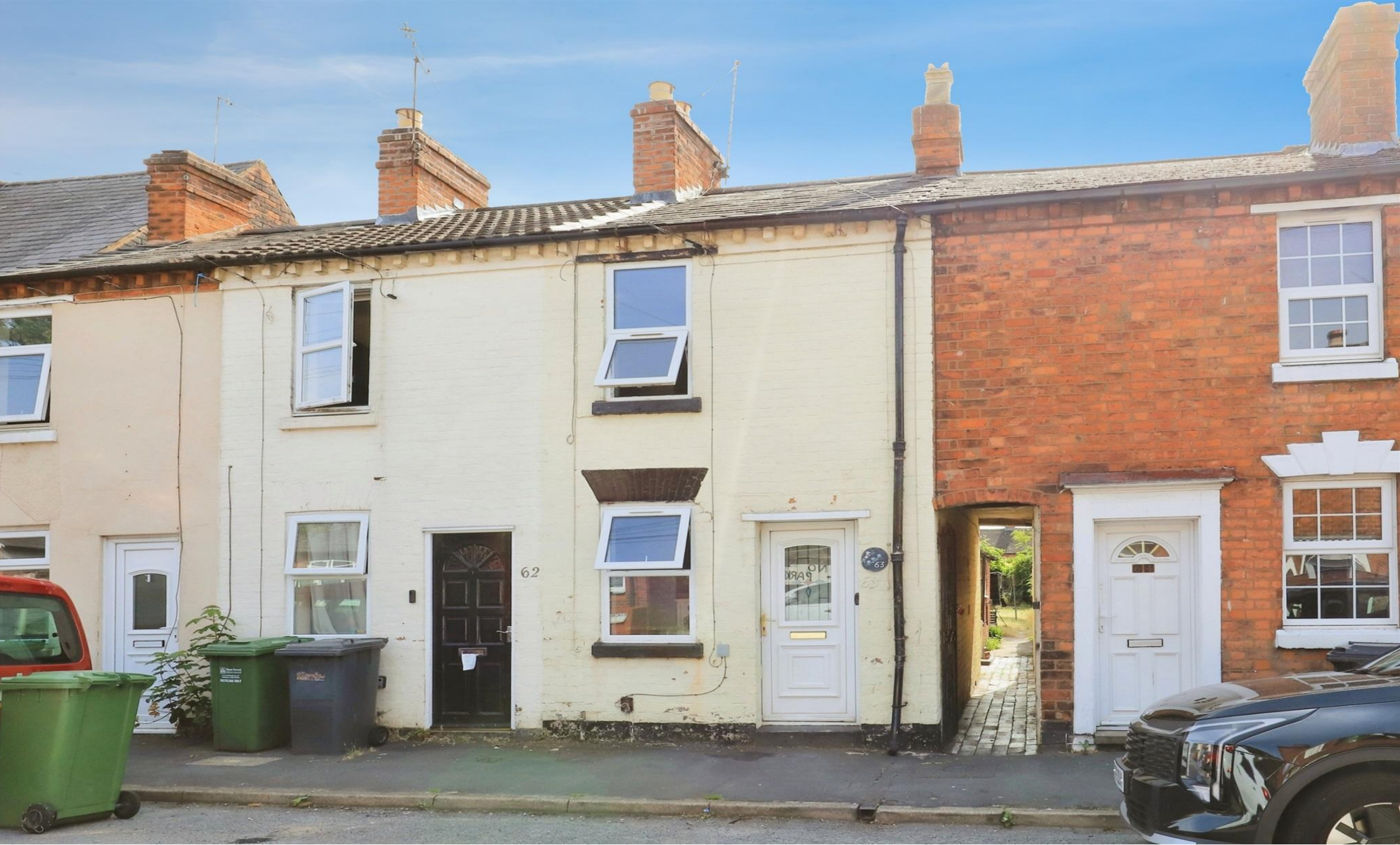
Lorne Street, Kidderminster DY10 1SX