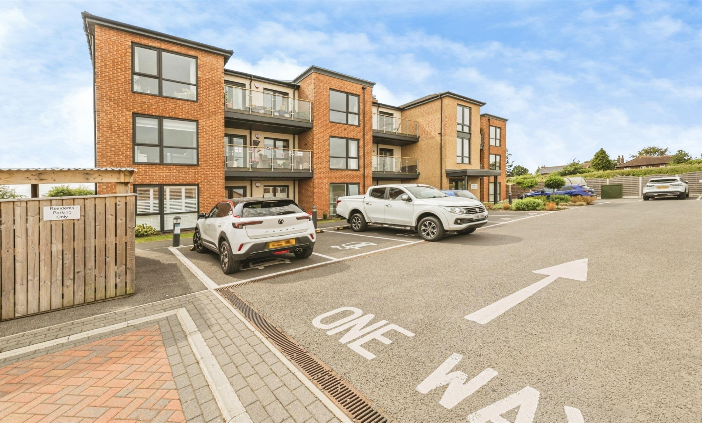
Waterton Gardens, Walton Wakefield WF2 6UH