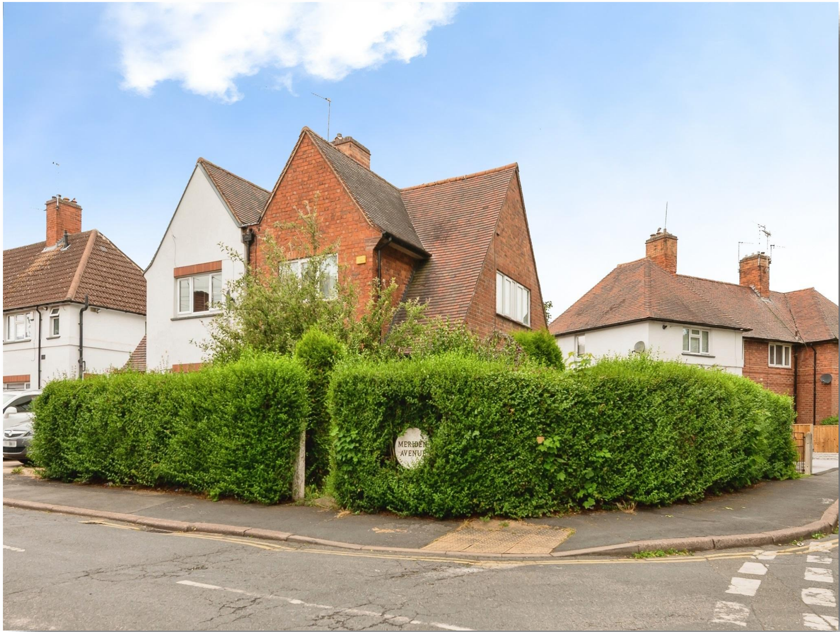
Meriden Avenue, Beeston Nottingham NG9 2TR