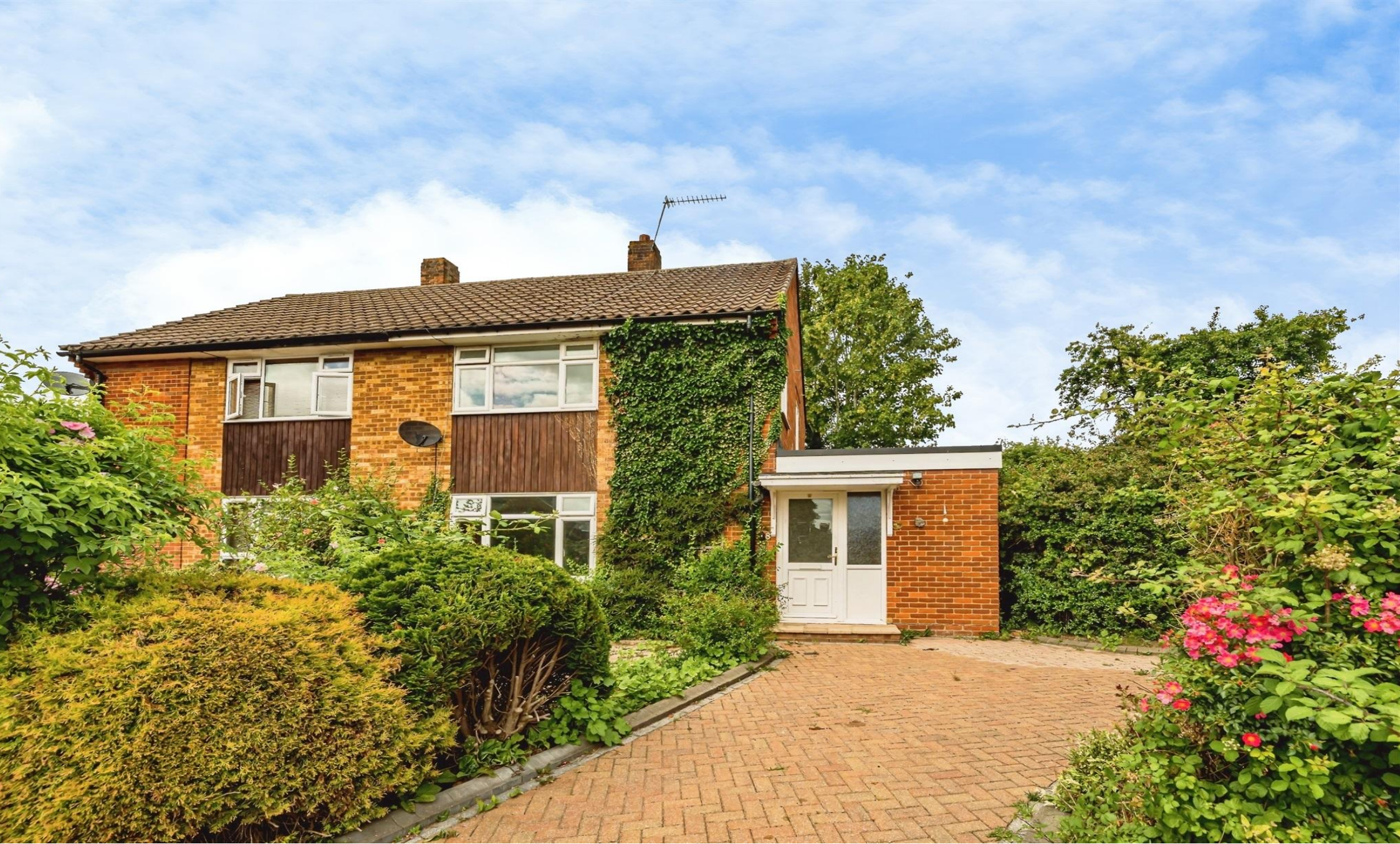
Southfield Gardens, Burnham Slough SL1 7NE