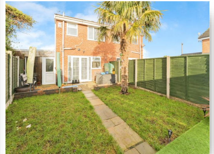
Moston Way, Great Sutton Ellesmere Port CH66 2RB