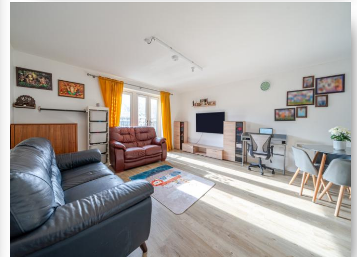
Apartment 29 Hythe Lodge, 157 Boyn Valley Road, Maidenhead SL6 4GB