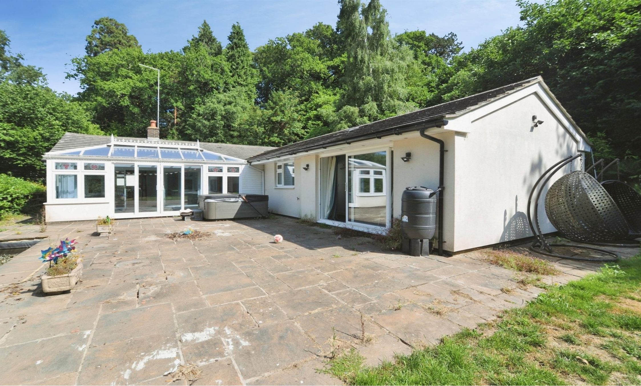
Badgers Bottom - Chowns Hill, Hastings TN35 4PA