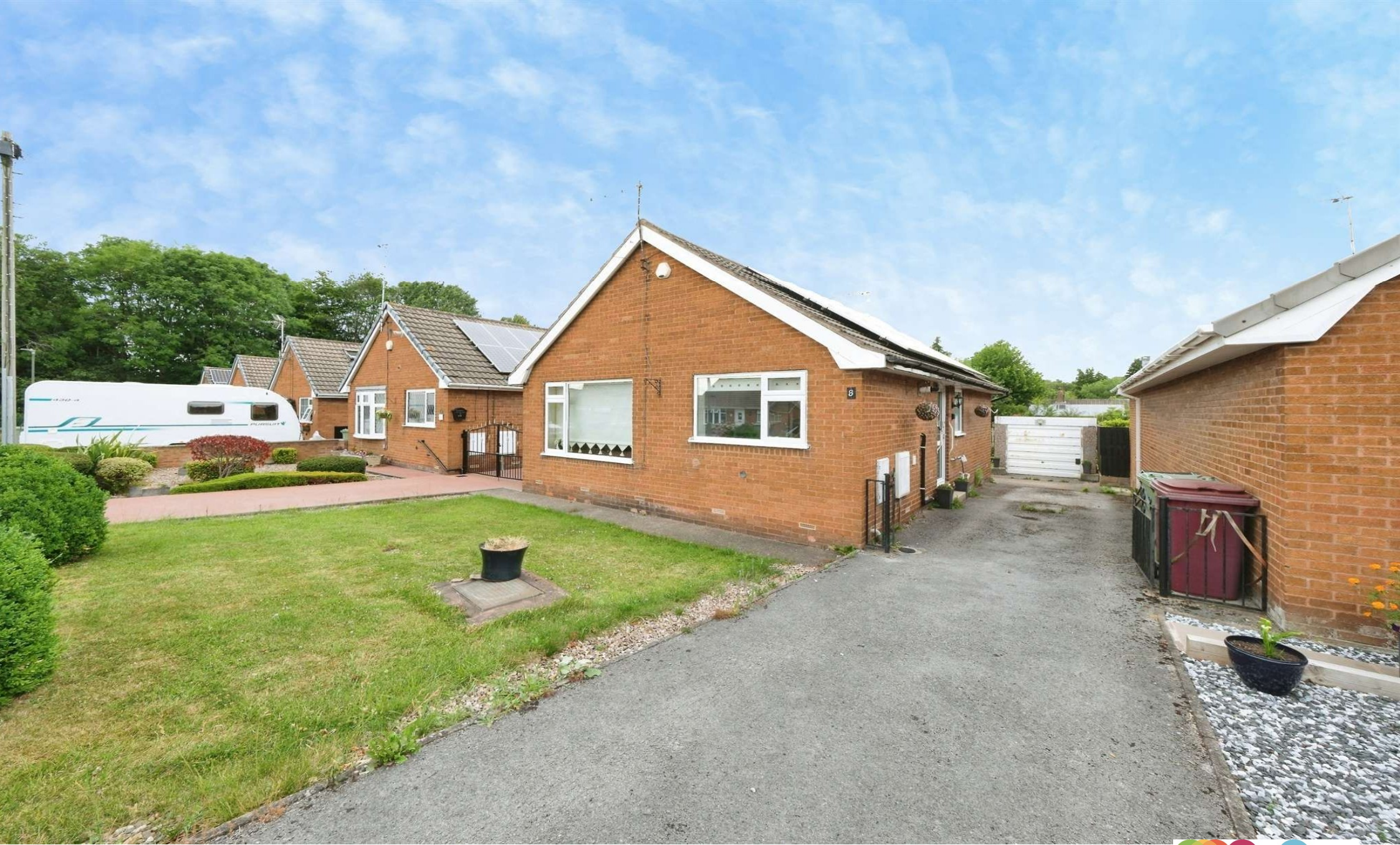
Danbury Close, Grassmoor Chesterfield S42 5HG