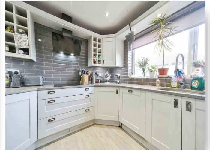
Fairbank, Shipley BD18 2EW