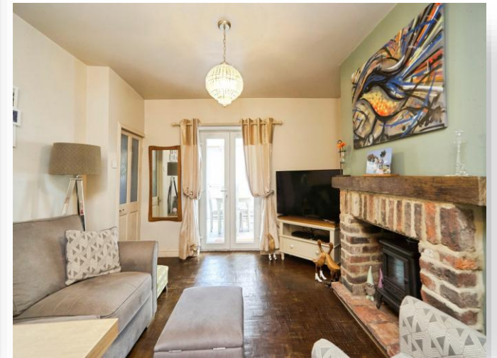
Moorside Terrace, BRADFORD BD2 3JA