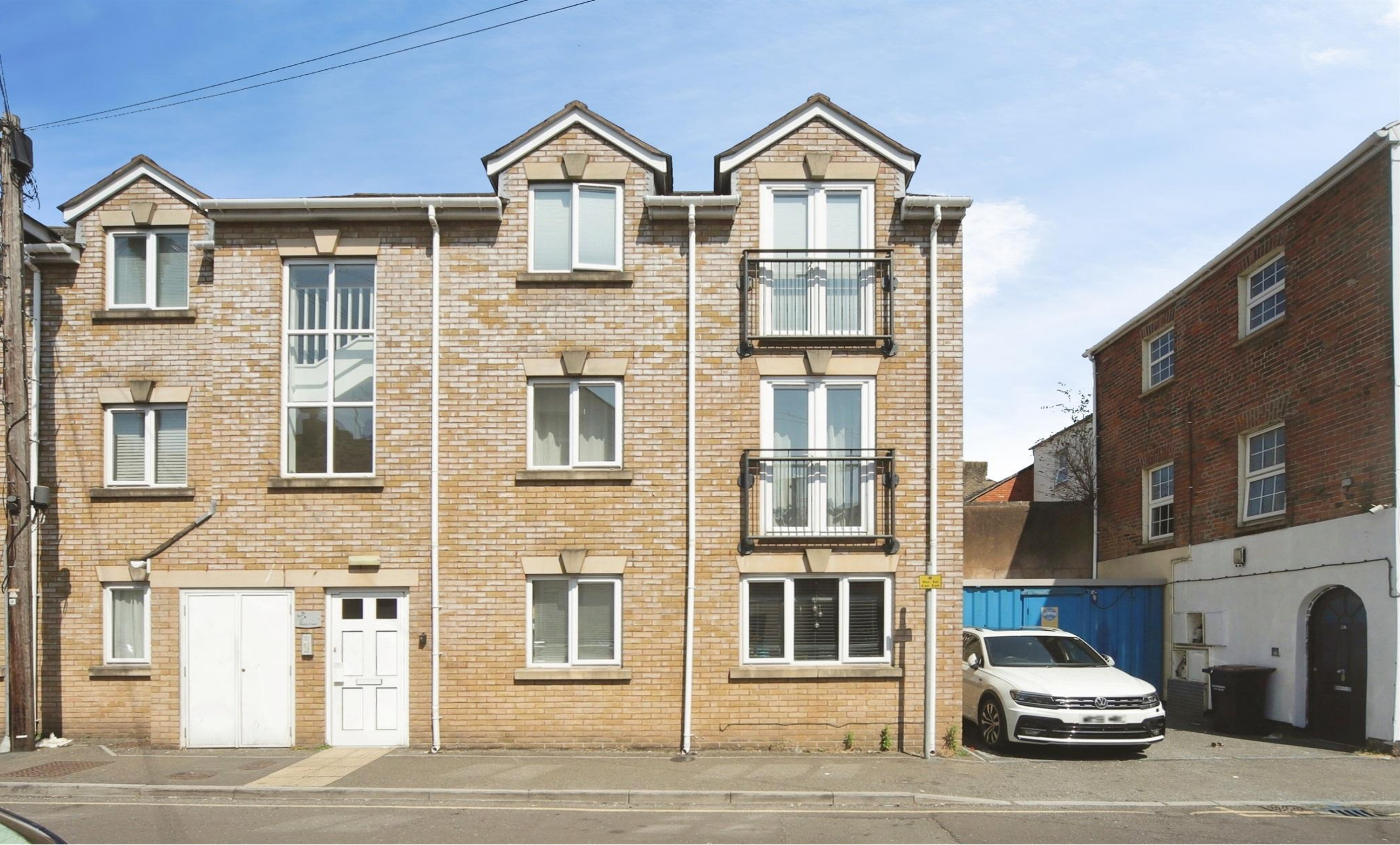
Maple Court Eastbourne Road, Taunton TA1 1TE