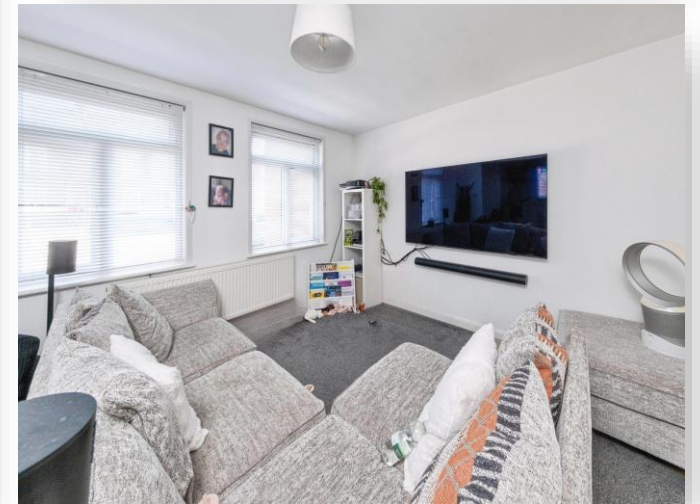
High Street, Newport Pagnell, MK16 8YX