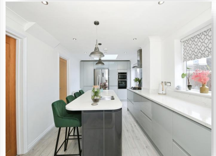
Shaw Drive, March PE15 9TB