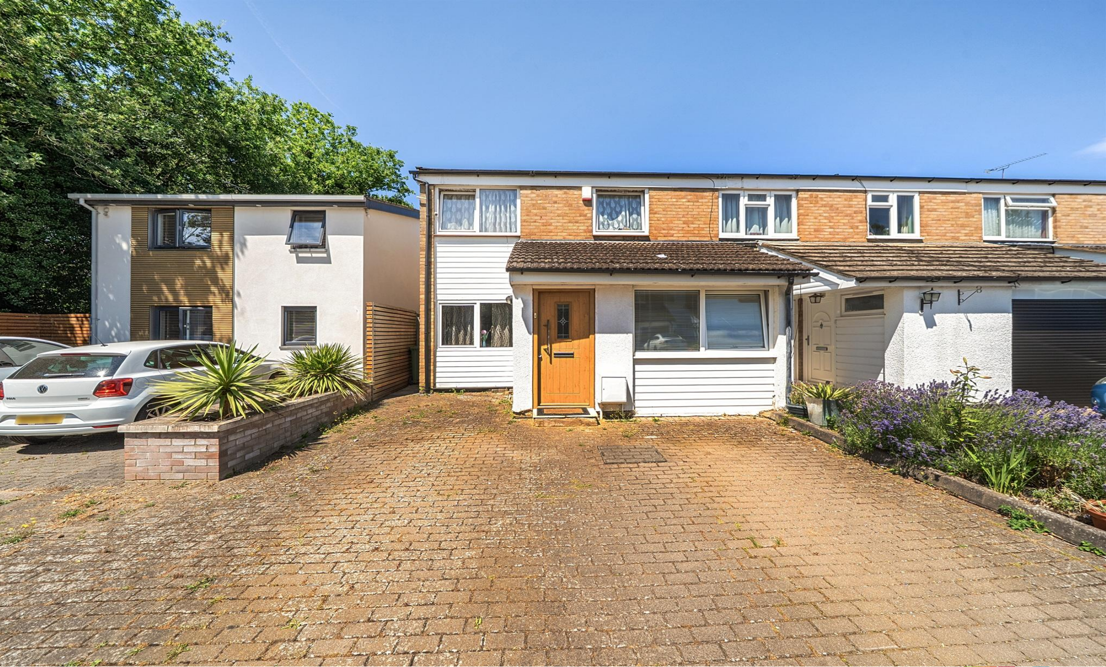
The Firs, St. Albans AL1 1UN