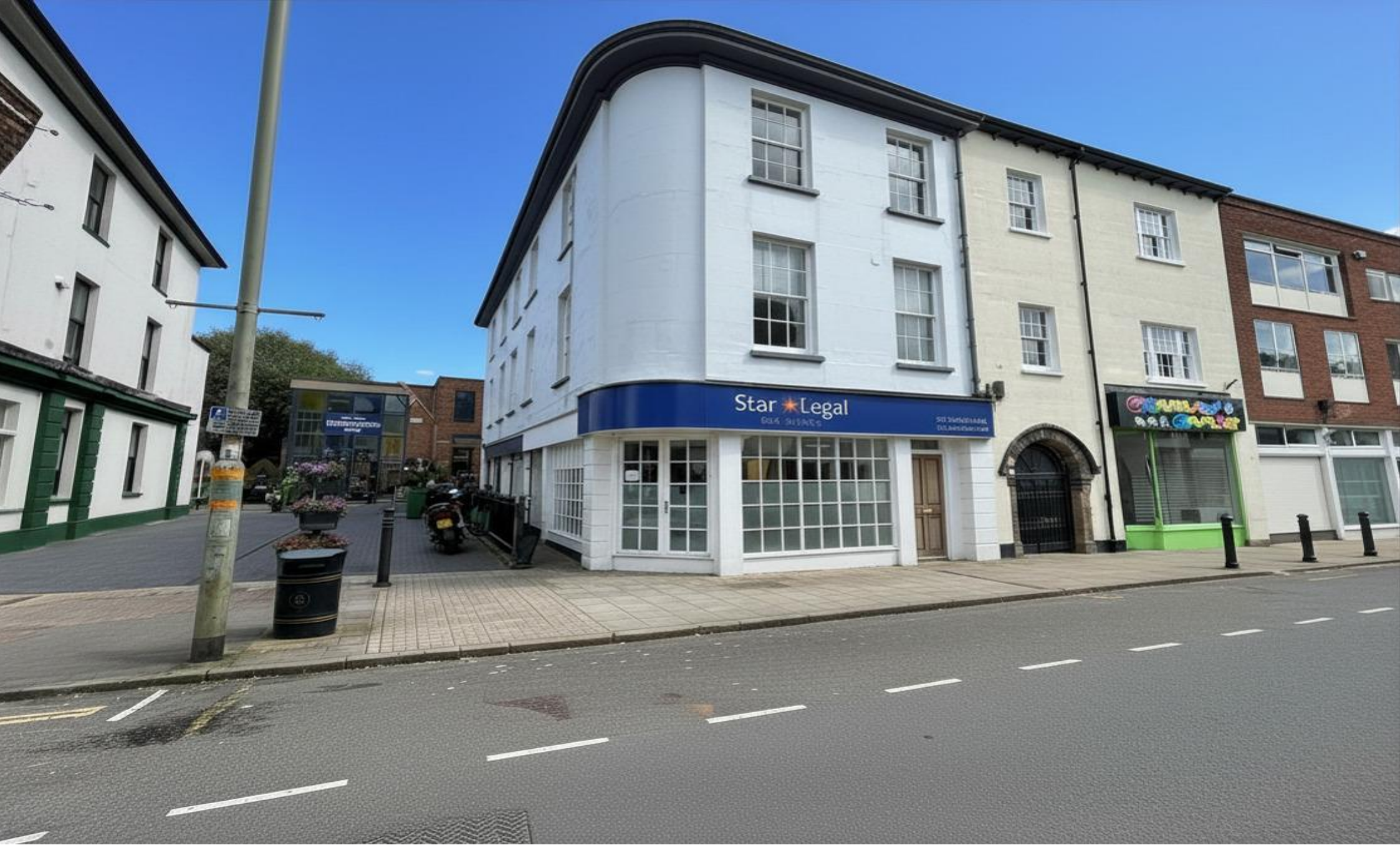
Publisher House, Bampton Street, Tiverton, EX16 6AH