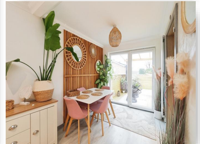
Chiswick Drive, LOUGHBOROUGH