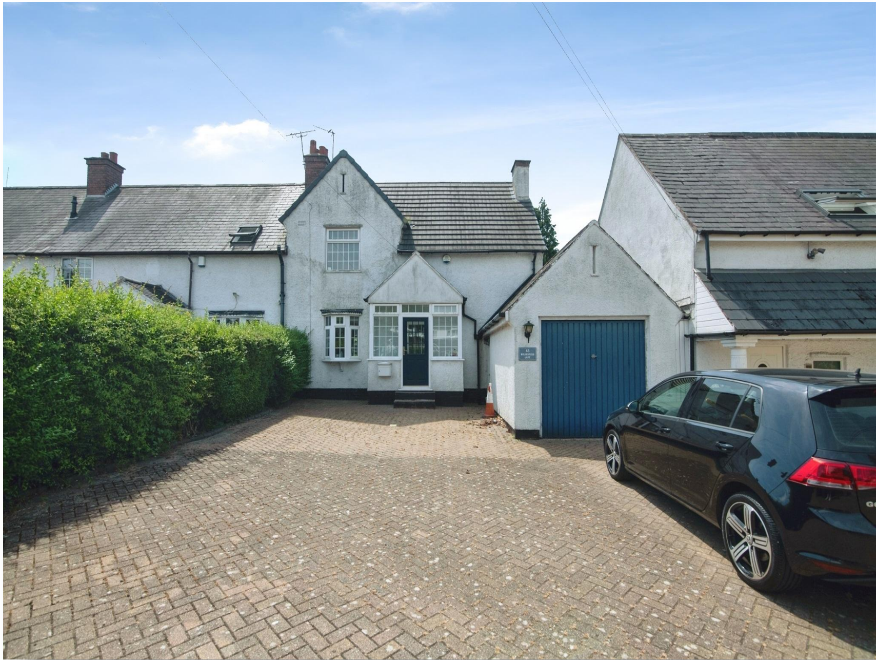
Wilderness Lane, Birmingham B43 7RT