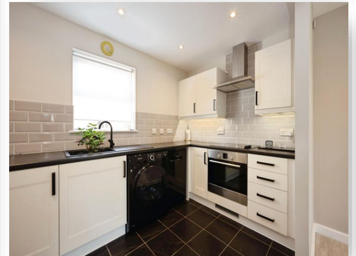
Falcon Mews, Stanbridge Road, Leighton Buzzard, LU7 4QX