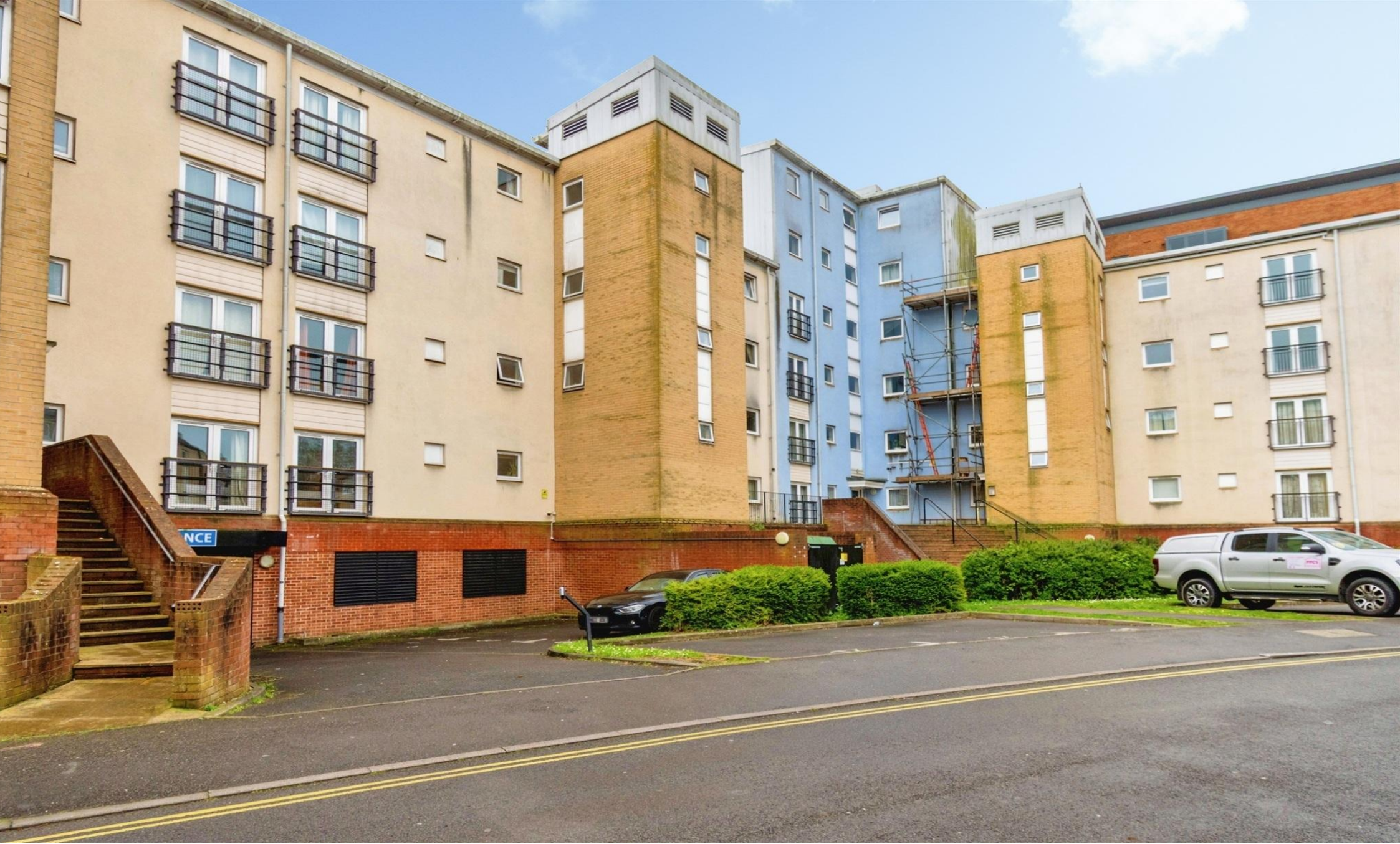
White Star Place, Southampton SO14 3GN