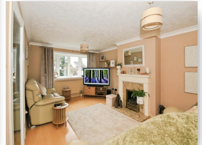
The Green, MARCH PE15 8JD