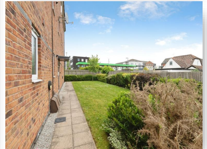
Cadet Drive, Shirley Solihull B90 2FD