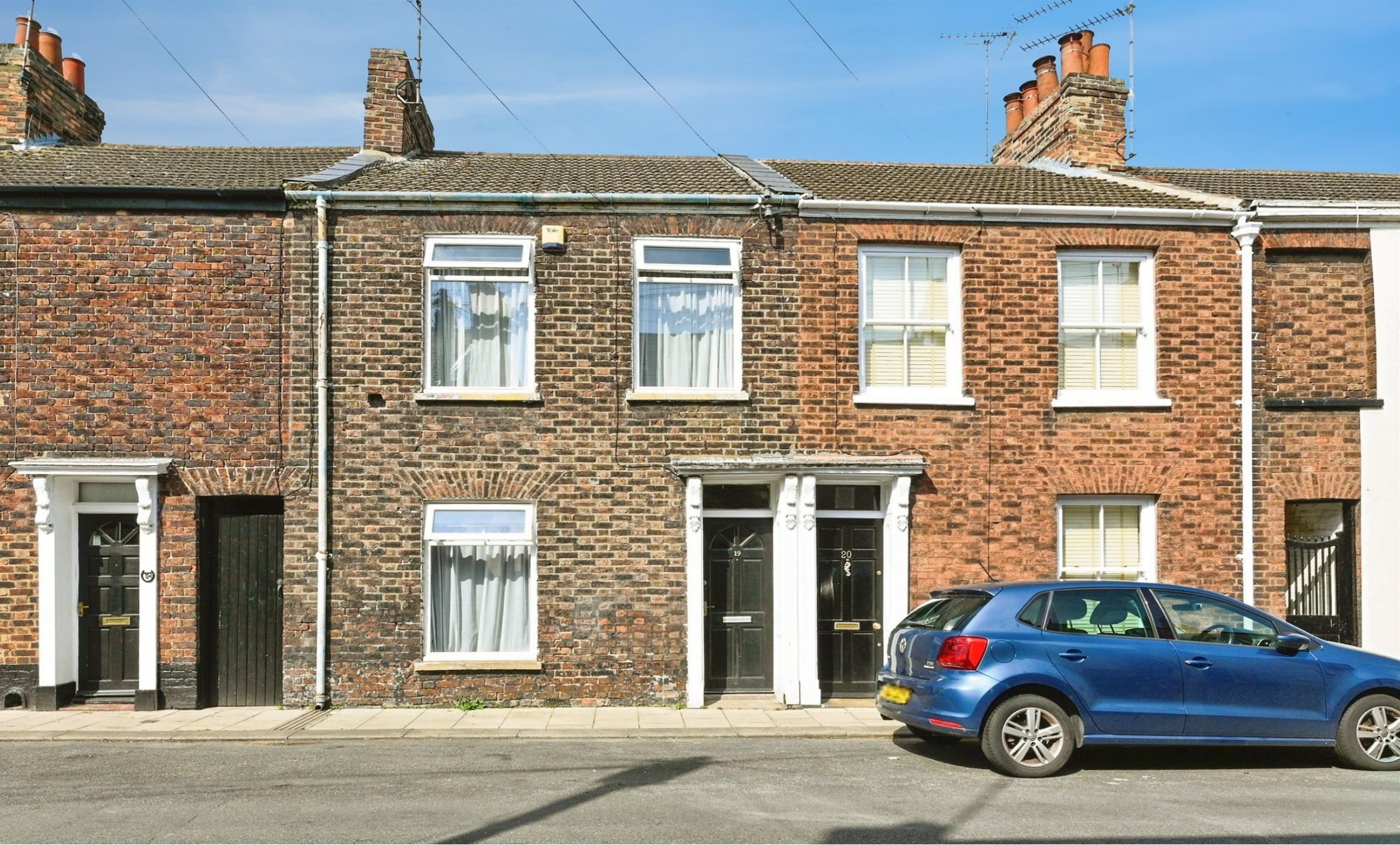
South Everard Street, King's Lynn, PE30 5HJ