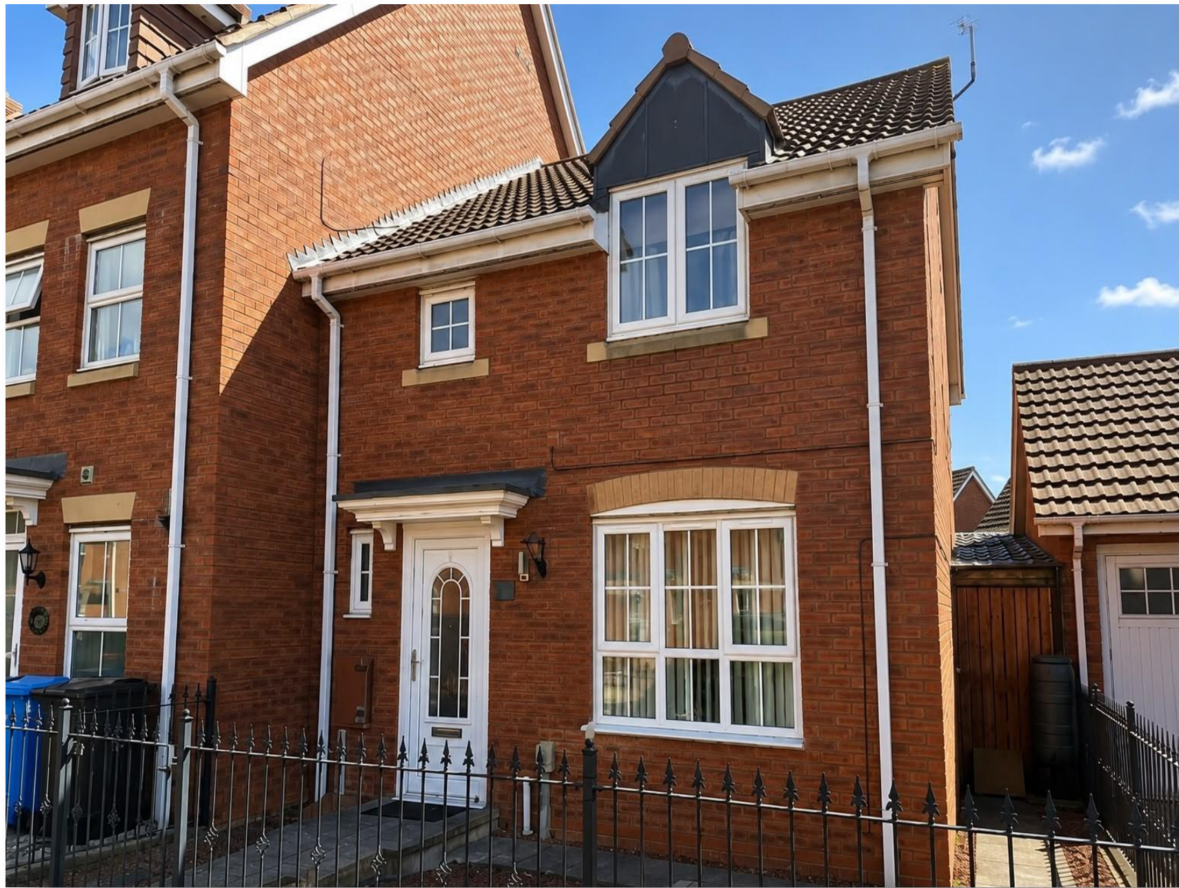
Woodheys Park, Kingswood, Hull, HU7 3AN