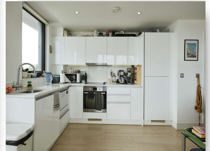
Blanche House, Dyke Road, Brighton BN1 3GY