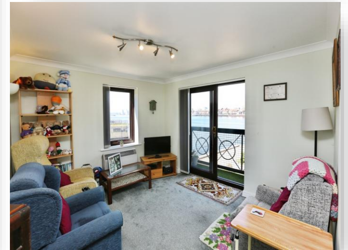
Spitfire Court, Mitchell Close, Southampton SO19 7TN