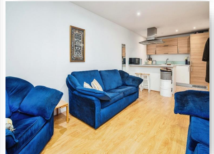
The Waterfront, Hertford, SG14 1SD