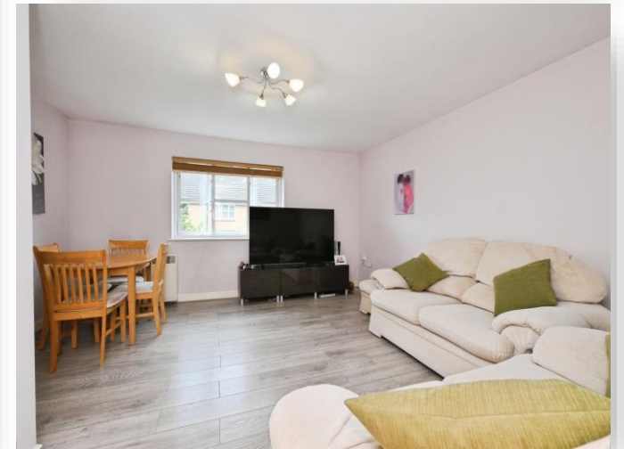
Plomer Avenue, Hoddesdon EN11 9FQ