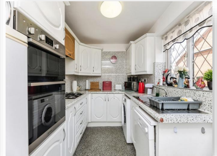
Broadcroft Chase, Tingley Wakefield WF3 1TY