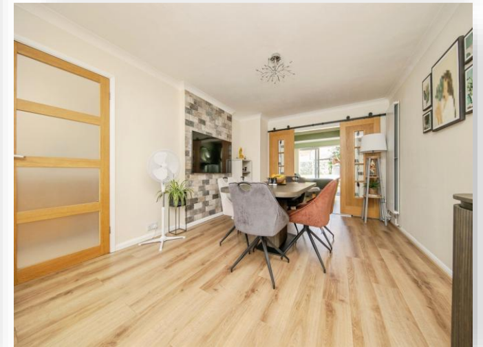
Nacton Road, Ipswich, IP3 9JW