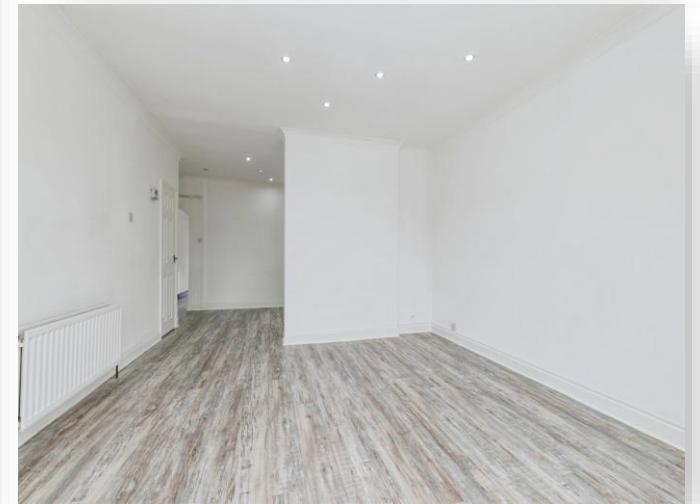
Dorset Crescent, Billingham TS23 4AU