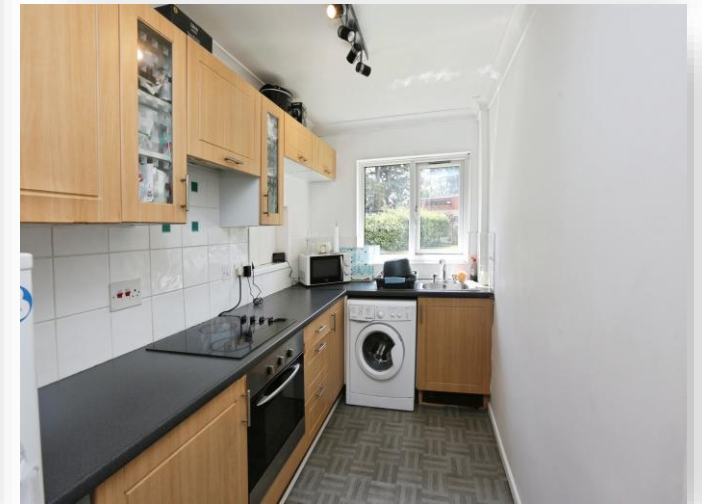
Cranbury Court, Cranbury Road, Southampton SO19 2RT