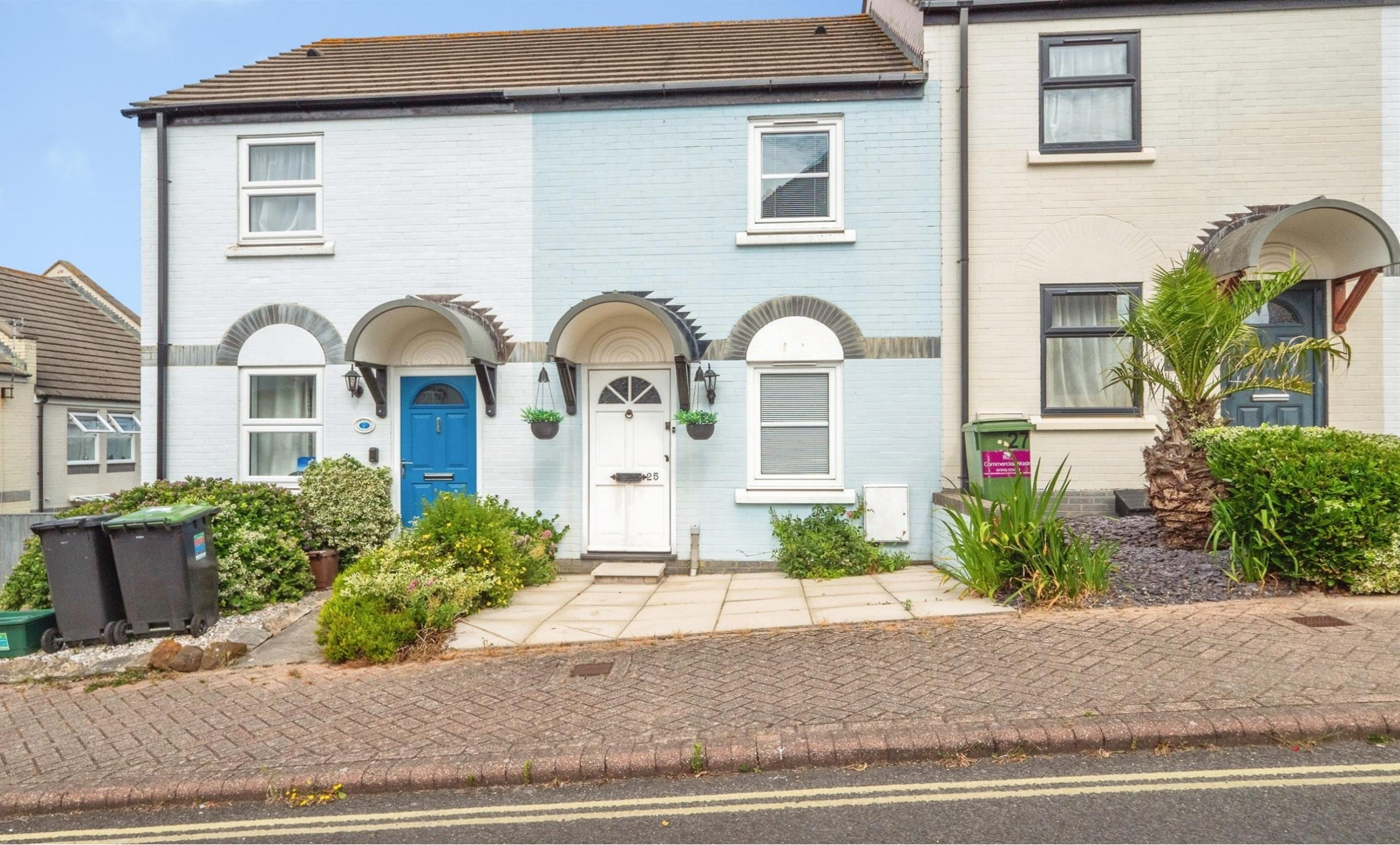
The Maltings, Weymouth DT4 8SP