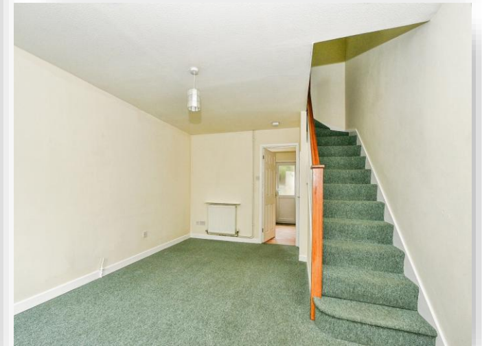
Lysley Close, Chippenham SN15 3UJ