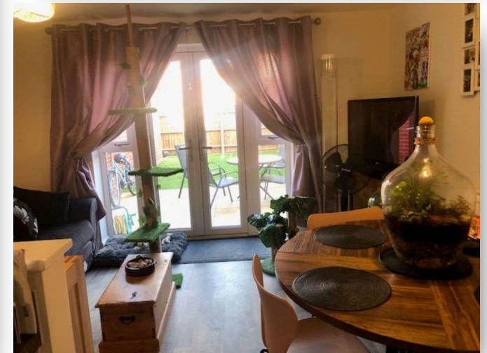
Grand Junction, Broughton Aylesbury HP22 7EA