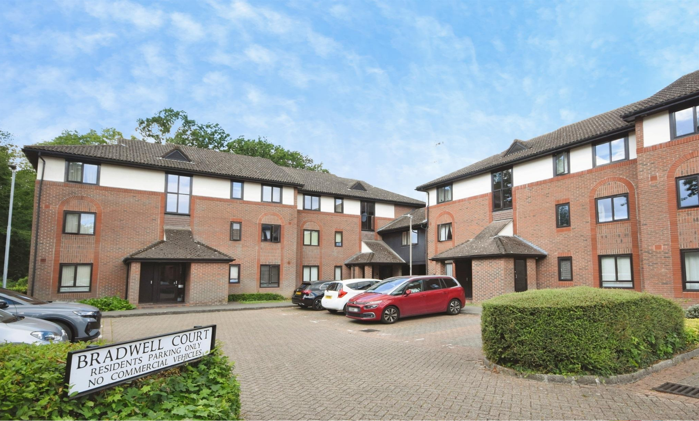
Bradwell Court, Bradwell Green, Hutton, Brentwood, CM13 1YR