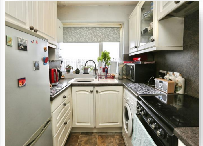
Gainsford Road, Southampton SO19 7AU