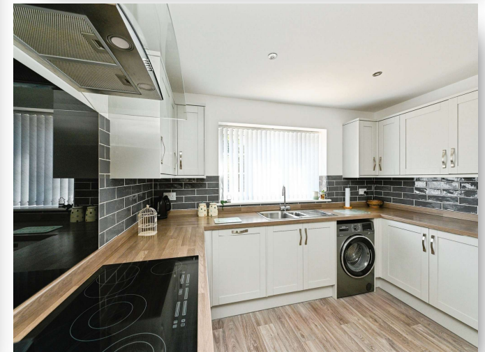
Robin Hill, Hunstanton Road, Heacham, PE31 7SS