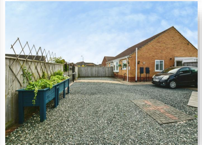
David Drive, Skegness PE25 1TS