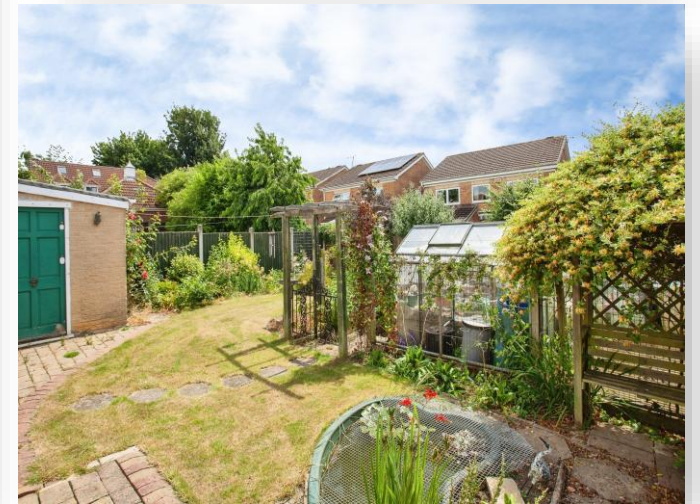
Church Lane, Dinnington Sheffield S25 2LY