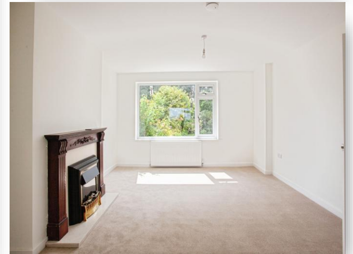
Hill Close, Brecks Rotherham S65 3JE