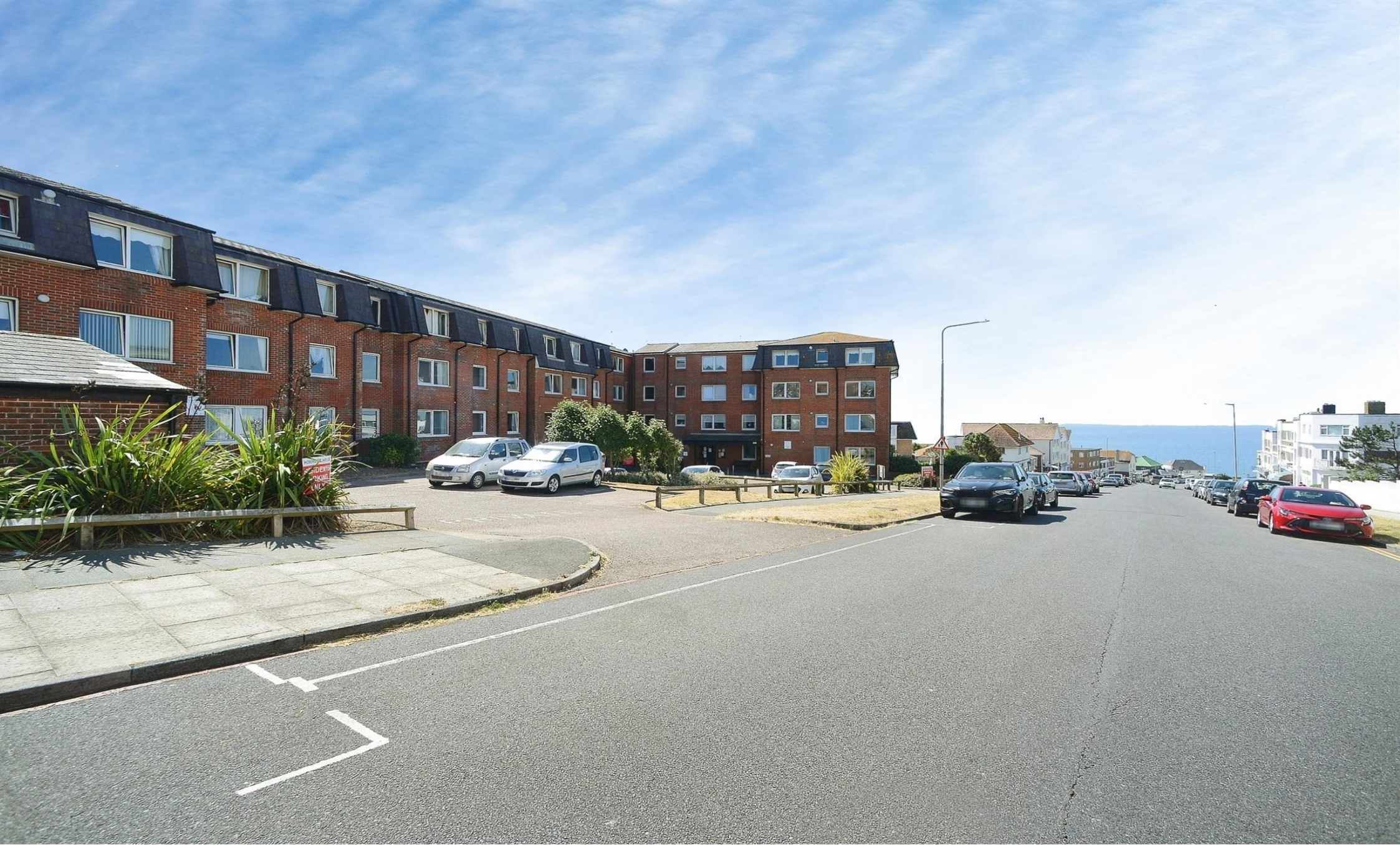
Homeridge House Longridge Avenue, Saltdean Brighton BN2 8RQ