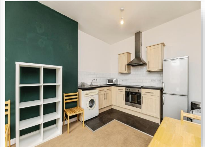
Flat 3 Queen Street, Morley Leeds LS27 8HE