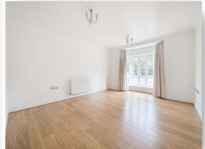
Flat 1 Old Orchard, Shoppenhangers Road, Maidenhead SL6 2GW