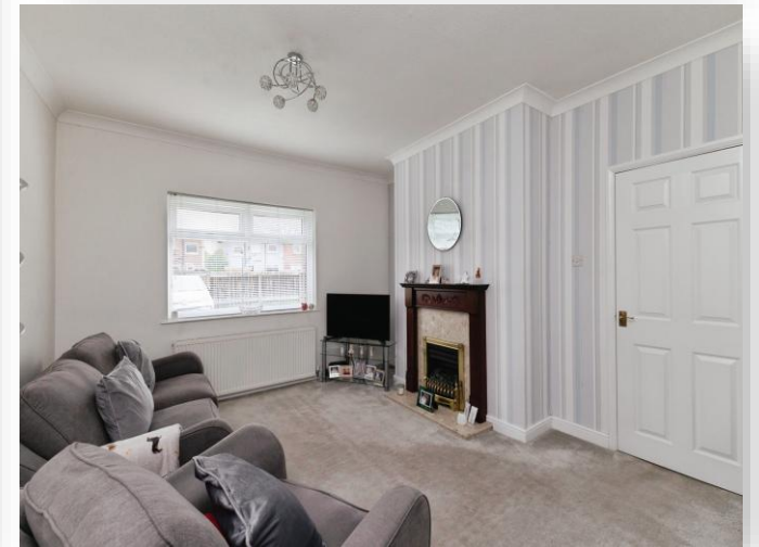
Easson Street, Middlesbrough TS4 2SL