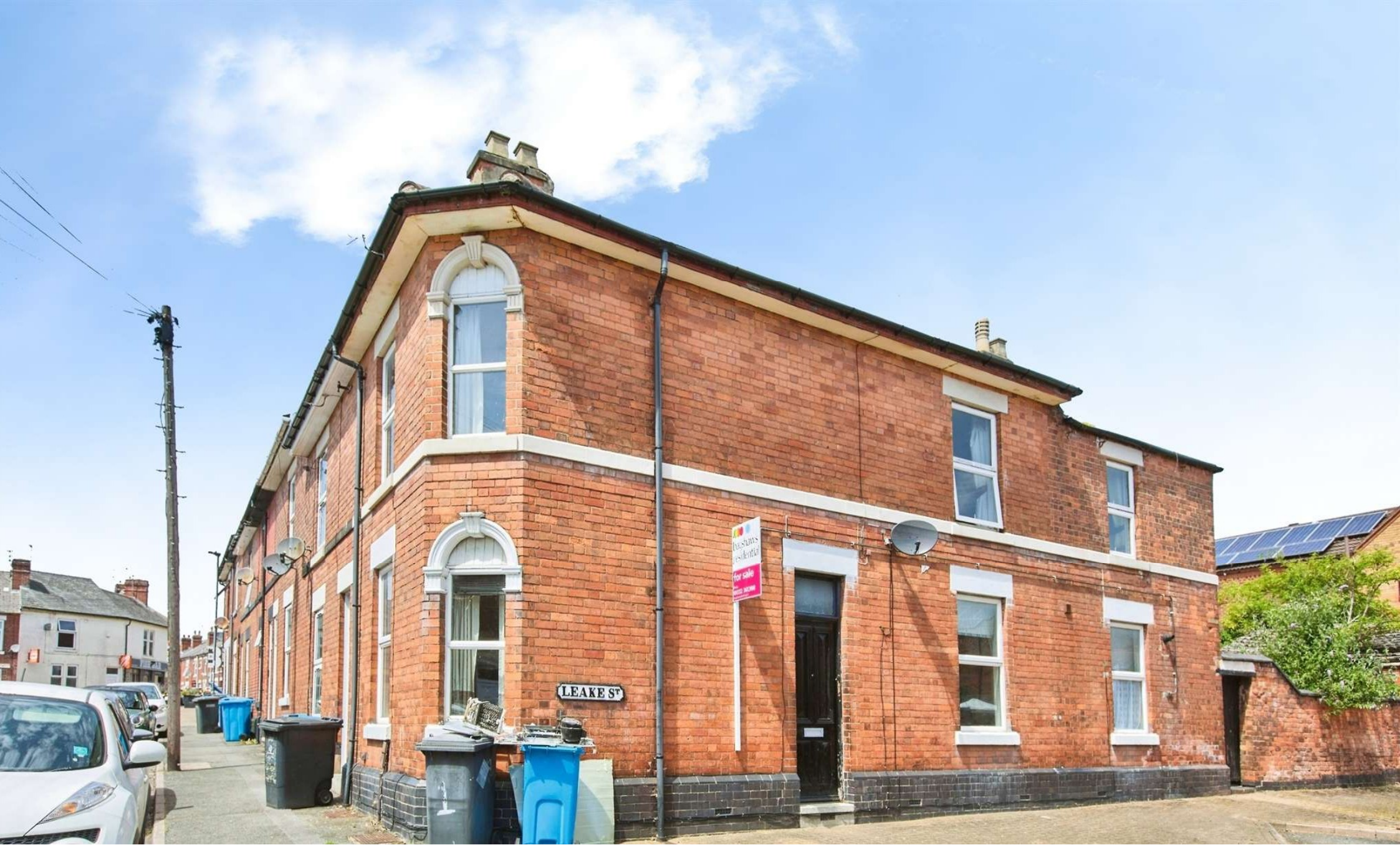
Leake Street, Derby DE1 1GQ