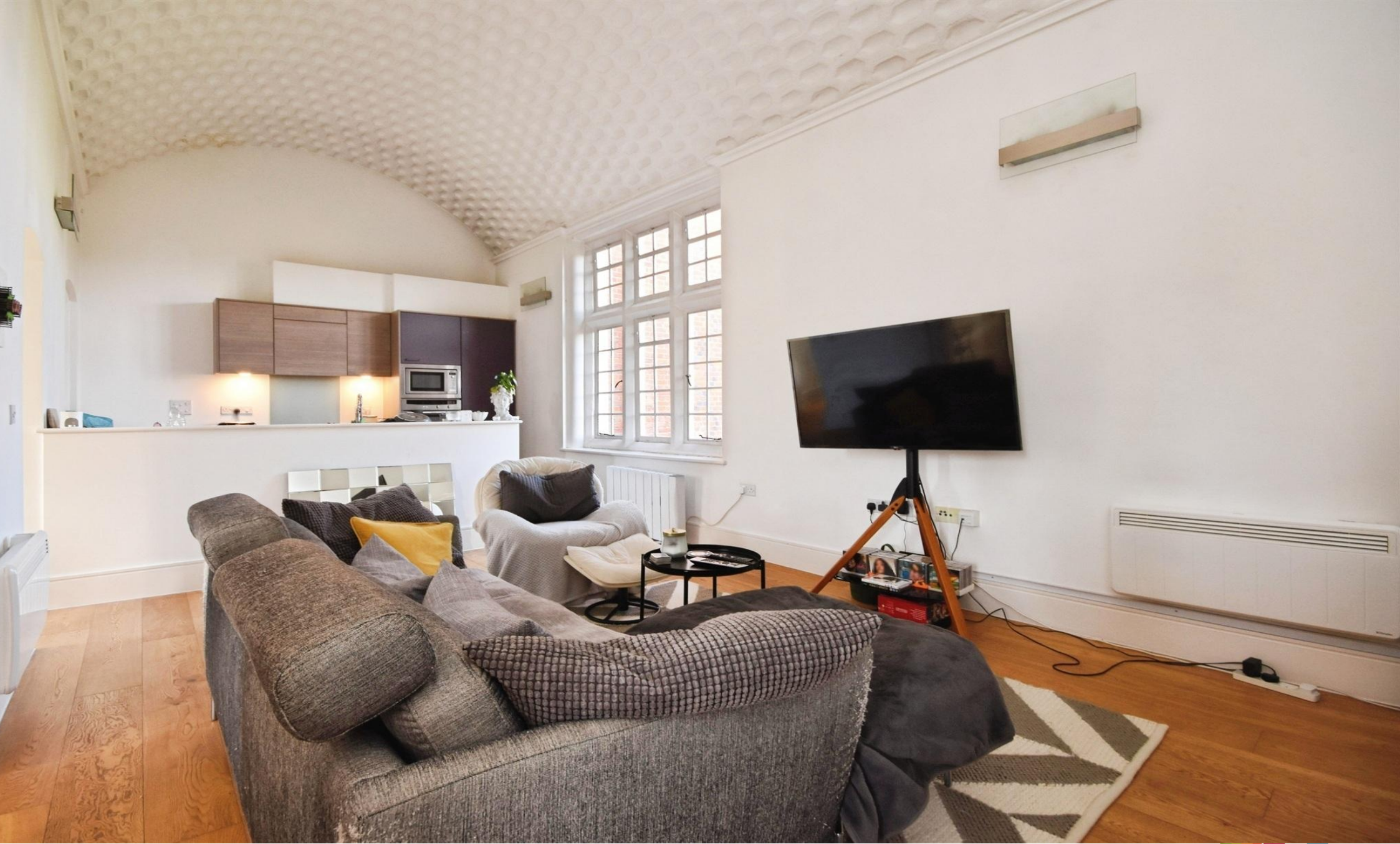
Kavanagh Court, The Galleries, Warley, Brentwood, CM14 5FF