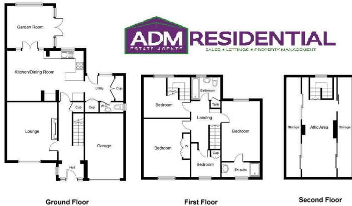
10 Roman Avenue Mount