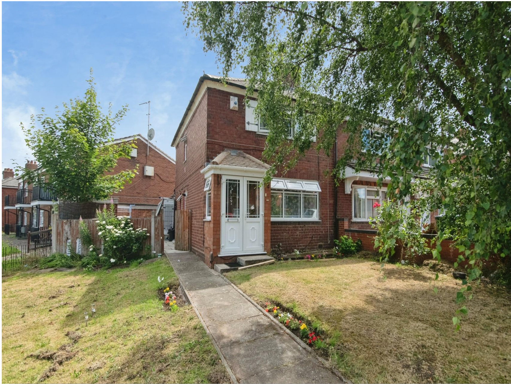
Marsh Lane, West Bromwich B71 2DL