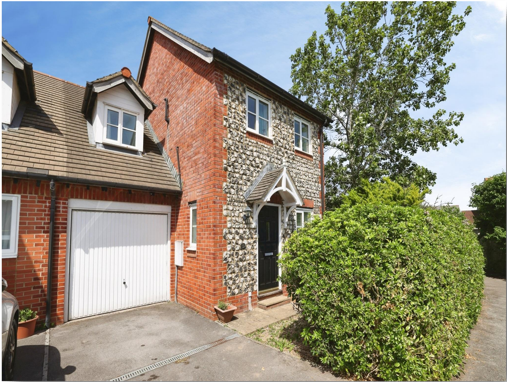
Dawbeney Drive, Amesbury Salisbury SP4 7TR