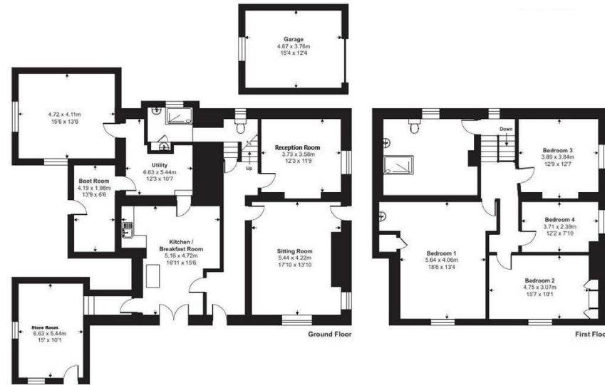
Floor plan produced in accordance with RICS Property Measurement 2nd Edition, incorporating International Property Measurement Standards (IPMS2 Residential). © nichecom 2024. Produced for Stags. REF: 1219521

IMPORTANT: Stags gives notice that: 1. These particulars are a general guide to the description of the property and are not to be relied upon for any purpose. 2. These particulars do not constitute part of an offer or contract. 3. We have not carried out a structural survey and the services, appliances and fittings have not been tested or assessed. Purchasers must satisfy themselves. 4. All photographs, measurements, floorplans and distances referred to are given as a guide only. 5. It should not be assumed that the property has all necessary planning, building regulation or other consents. 6. Whilst we have tried to describe the property as accurately as possible, if there is anything you have particular concerns over or sensitivities to, or would like further information about, please ask prior to arranging a viewing.